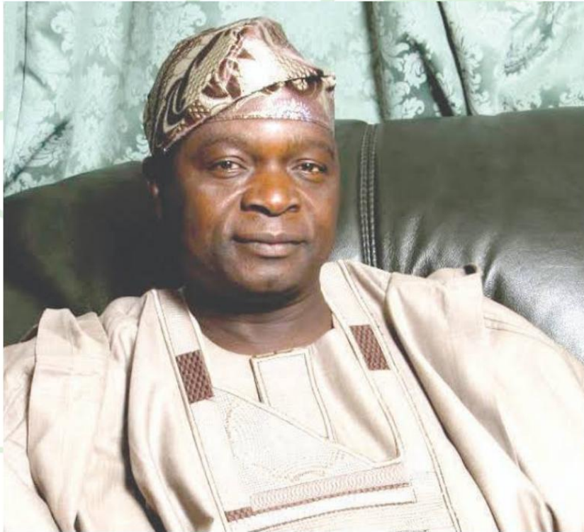
Prince (Dr) Olagunsoye OYINLOLA